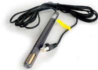
Humidity & temperature sensor