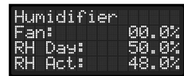
Smartbox Top Menu